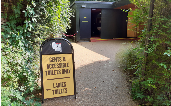
31. Entrances to the Gents and Accessible Toilets are opposite the lawn.