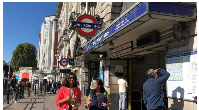
18. Turn right into the station.