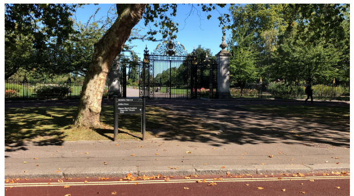
12. Carefully cross the road ahead of you toward the gates.