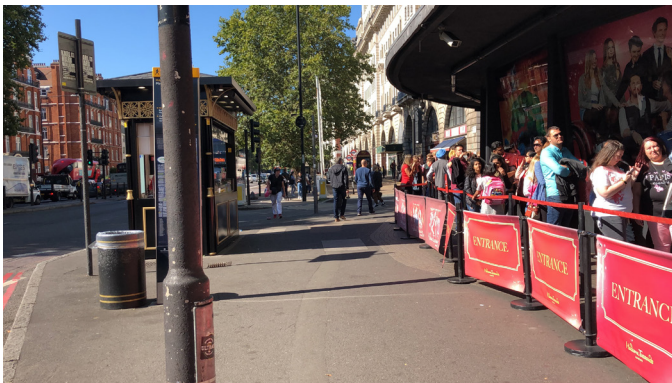
17. Continue past Madame Tussauds.