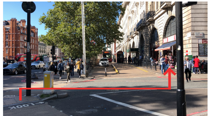
18. Carefully cross the road at Allsop Place.

[You'll need to move across to the right hand side of the divide in the road (as indicated by the arrow above).]