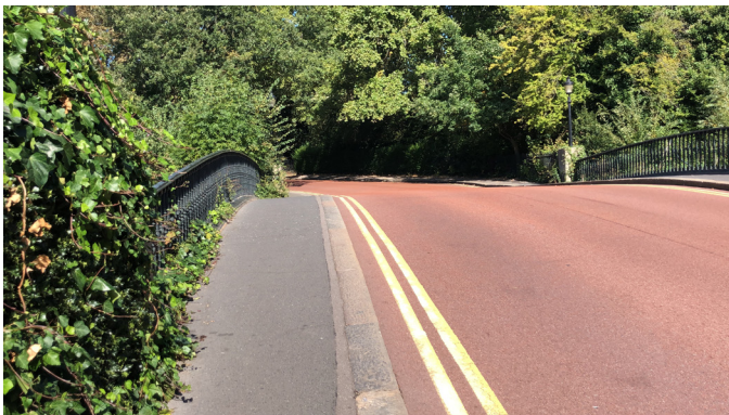
9. Continue straight over York Bridge.