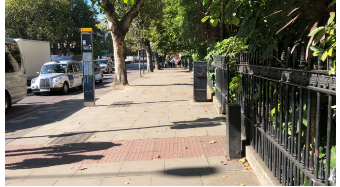
16. Continue along the road towards Madame Tussauds.