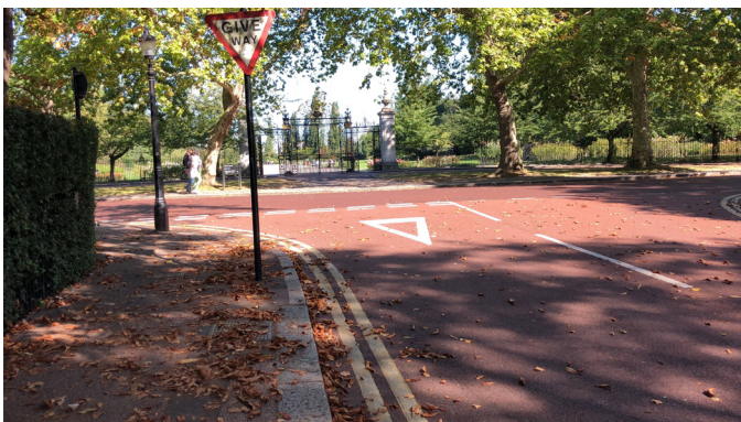
11. Ahead, you'll notice big wrought-iron gates. Continue walking toward them.