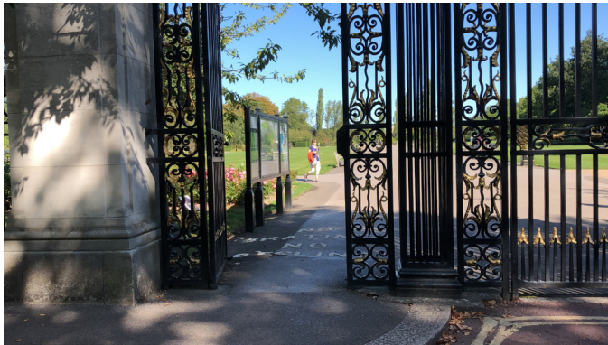
13. Continue through the gates.