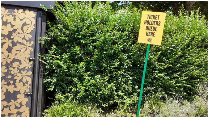
19. You will find a 'Ticket Holders Queue' sign on a tall pole. Please queue here.