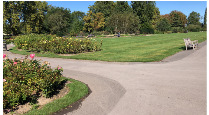
14. Take the left turn off of the path ahead of you.