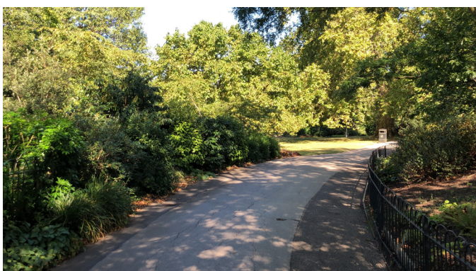
17. Keep going.

[Don't worry if you don't arrive at the theatre right away - it's well hidden amongst the trees.]