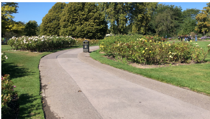
15. You're almost at the theatre. Keep following this path.