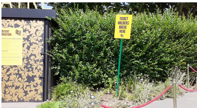
21. As you enter the venue, your bags will be checked.

[If you booked more than 28 hours prior to the performance, you would also have received an SMS text on your smart phone with a mobile ticket. Please have either your mobile ticket or printed e-ticket ready for scanning.]