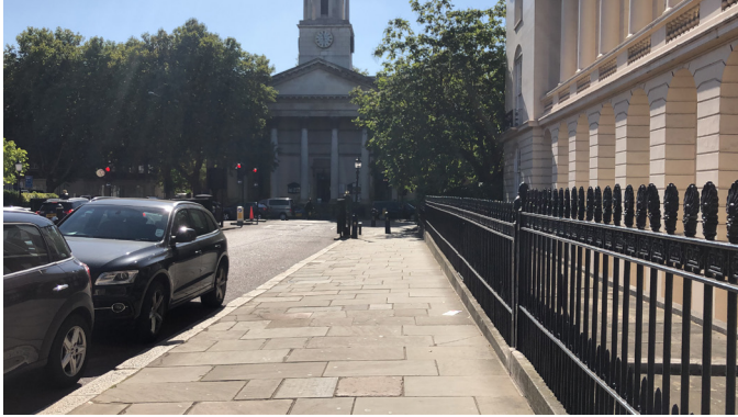
15. Continue until you reach the busy road ahead - Marylebone Road. Then turn right.