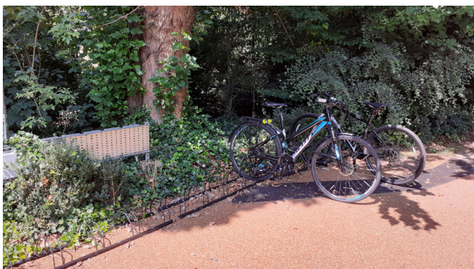
23. To the left on the far side of the picnic lawn is a Bike Rack.

[Please note: do not leave your bikes in the Park as gates are locked at dusk.]