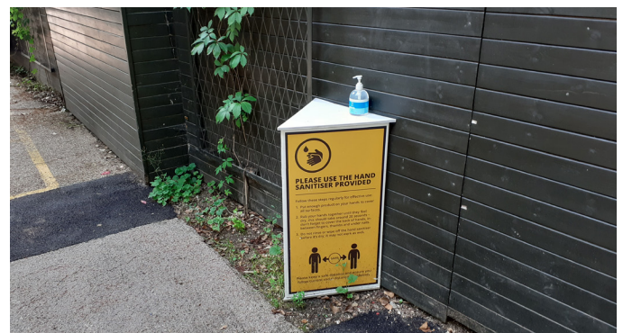
22. There is hand sanitiser available in the theatre.

[Please note: Picnic baskets or other large bags are not permitted.]