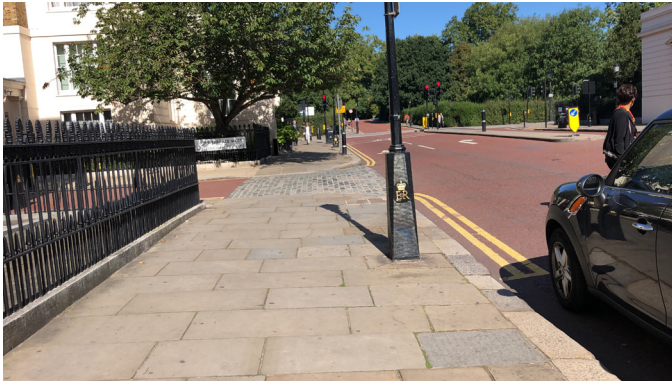
7. Ahead there are some traffic lights and a bridge to Regent's Park.