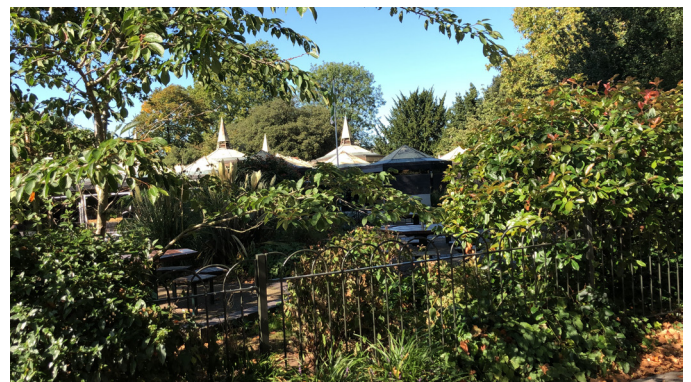
16. You'll pass a café on your left.