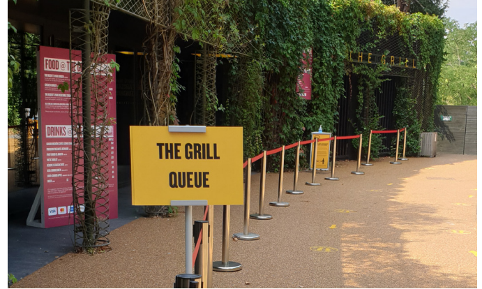
32. Continuing through the venue, you will find The Grill queue on your left and the lawn on your right.