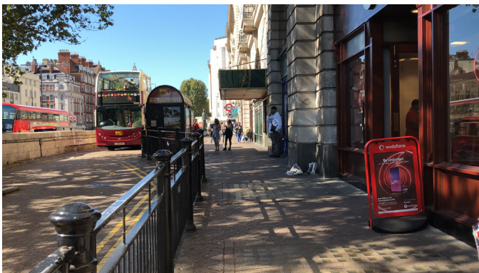
17. Up ahead you'll see Baker Street Underground Station.

[You'll need to move across to the right hand side of the divide in the road (as indicated by the arrow above).]