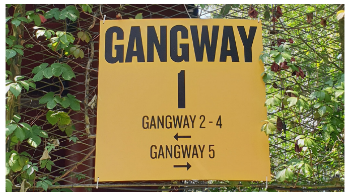
24. Upon arrival, check the Gangway number written on your ticket. To help find your Gangway, signs are located on the trellis above the bar area.

[Please note: do not leave your bikes in the Park as gates are locked at dusk.]