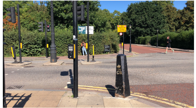
8. Carefully cross over at the traffic lights.