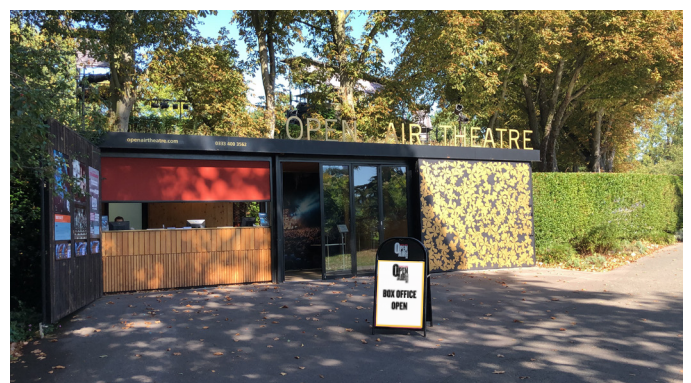
18. When you find the Box Office, you've arrived.

[Don't worry if you don't arrive at the theatre right away - it's well hidden amongst the trees.]