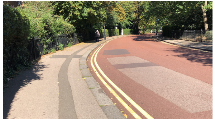
10. Follow the road as it curves slightly to the right.