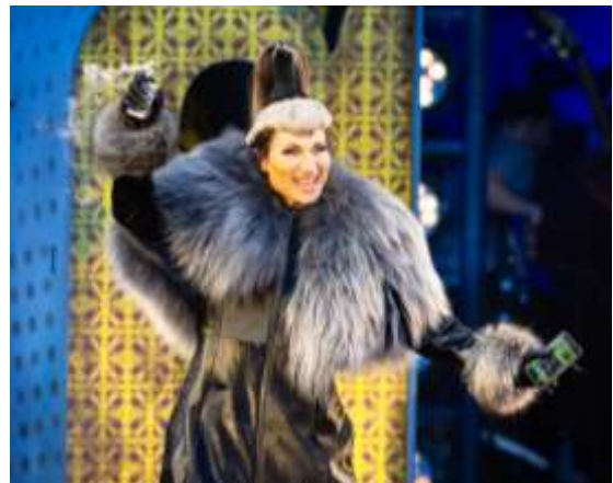
Cruella de Vil

Cruella De Vil arrives at the flat. Please note: There is a car horn before she enters. She is not a very nice lady and smells of pepper (that makes the dogs sneeze). Cruella asks to borrow Pongo and Perdi for a photoshoot, and it is Cruella who notices that Perdi is expecting puppies.