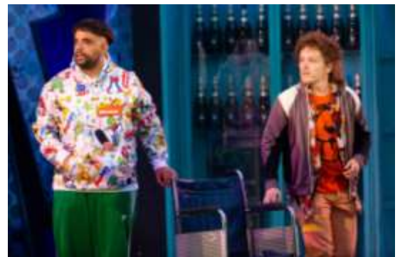
Jasper and Casper

Cruella enters in a wheelchair (following the bite from Perdi) with her nephews Jasper and Casper (who are quite funny). She realises that her attack on the dogs has been videoed and has gone viral. Cruella's new controversial status earns her an invitation to the Black and White Ball: the most exclusive event in town. Please note: Cruella decides that, as payback for Perdi biting her, she will make a fur coat from her puppies' to wear to the ball. She sings a song about this, and is joined by dancers. There are some thrusting movements during this number.