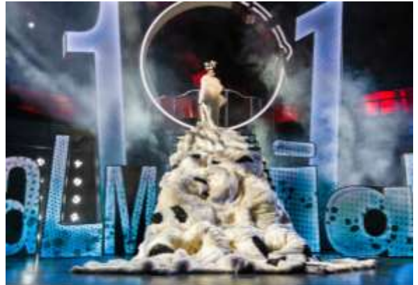
Cruella singing about making her fur coat

Cruella watches herself be interviewed on television. She then sings a song. Please note: she sings about how she will turn the puppies into a fur coat, and she visualises what this might look like. This song might become a bit frightening.