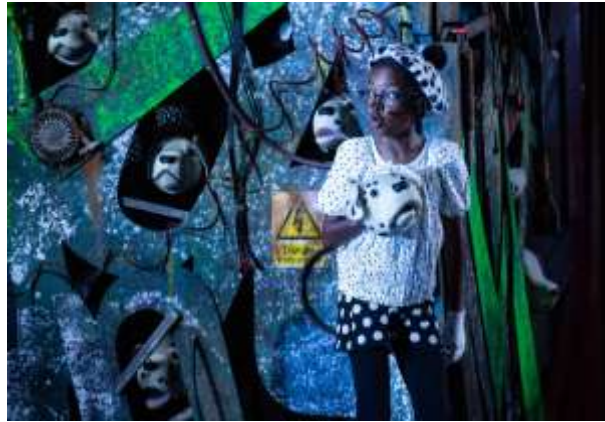
Button in front of the cage

Meanwhile Jasper and Casper are at Hell Hall, an old animal testing laboratory where nearly 100 puppies are being kept in electrified cages. As they leave, Patch, Lucky, Spud and Button (four of Perdi's puppies played by children) escape their cage. Tabby, a cat, enters and the puppies try to persuade her to help them. Tabby overcomes her prejudice against dogs and tells them about the Twilight Barking.